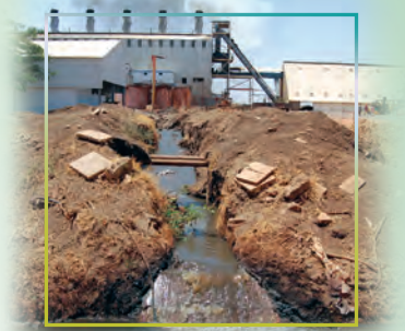
The factory has polluted the river.