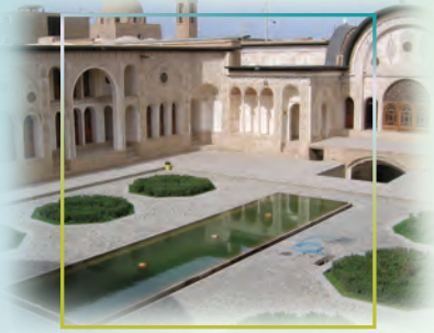
Many Iranian old houses are famous for their beautiful yards .