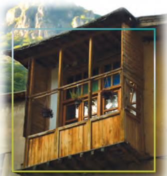
My uncle often sits in the balcony , has a cup of coffee and reads a book.