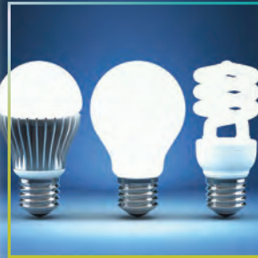
The new light bulbs consume less electricity.